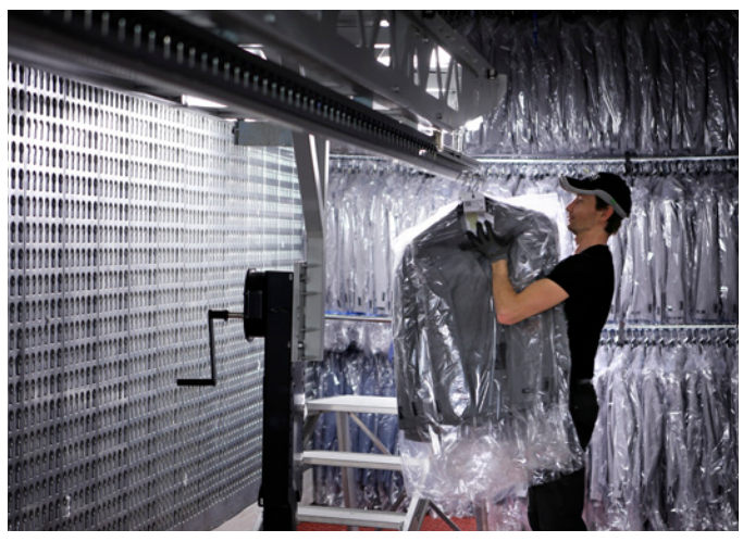
Shipping garments on hangers to your stores reduces store labor.