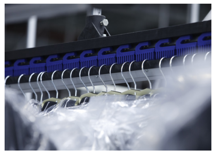
The GOH system provides you with complete control over items at all times.