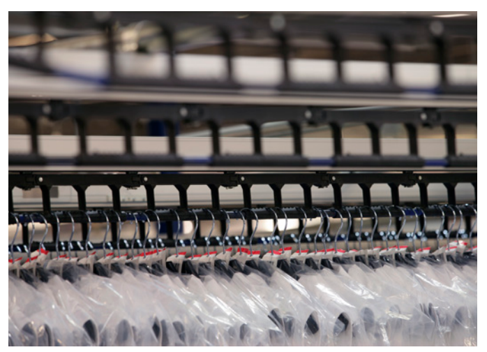
Garments can be routed easily and quickly through the warehouse.

Sort and sequence items with a wide range of advanced algorithms designed to optimize efficiency.