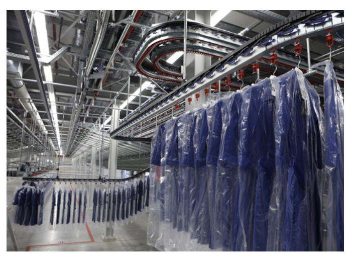
Dematic sort algorithms help you easily sort items by style, size and department.

Restock retail locations faster with GOH sequencing. Orders can be delivered to store locations sequenced by delivery route, department, size, style, and other criteria, making replenishment easier and faster.