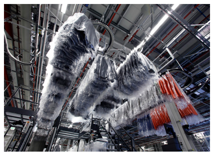
Use overhead space for storage and reserve floor space for actual work.